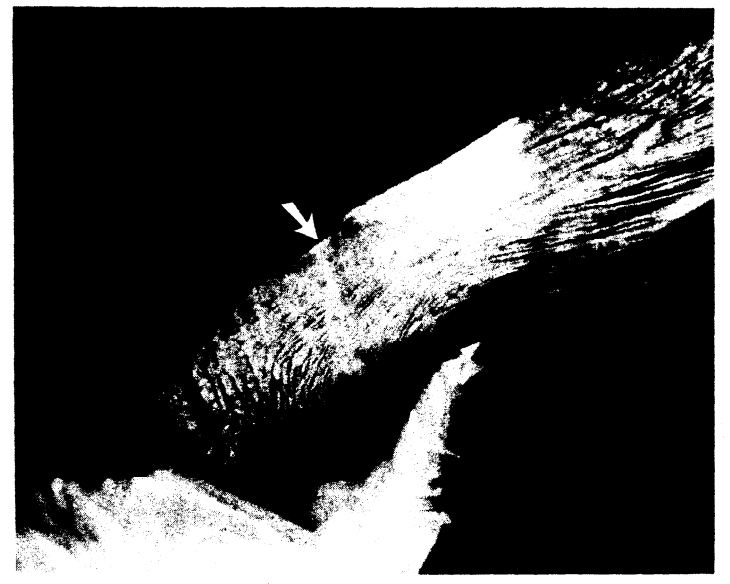
Figure 2. Stallion ring scar.

The stimulus mare is another important factor that can affect stallion behavior. Most stallions will respond or can -be trained to respond adequately to a suboptimal stimulus animal or even a breeding dummy mount mare. For most stallions, however, a mare in strong natural estrus elicits a stronger sexual response than a breeding dummy or an ovariectomized stimulus mare. The important visual or olfactory signals accounting for the difference in response remain a matter of speculation.